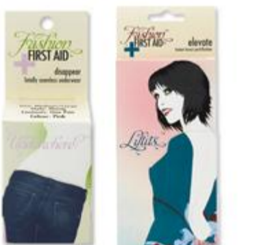
Fashion First Aid

Our favourite purveyor of make-up and skincare is picking up an exciting new brand! Sephora are always on the cutting edge of new beauty trends and have impeccable taste in the products they elect to sell. With more and more stores opening across Canada, they're gaining the street foothold that they've long held online. So, you can imagine how excited we were when we heard they've got a new hair-removal system coming in September. We simply can't wait to get our hands on the No/No!